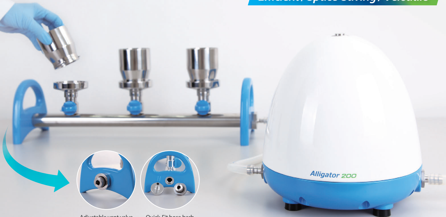
Adjustable vent valve